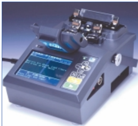
Model S176LP Low Profile design

The S176CR has the reverse layout of the S176CF, with the protection sleeve heater at the front and the monitor and keypad at the rear. The windshield opens from front to rear for easy removal or transfer of the splice to the protection sleeve heater. Like the S176CF, the CR can be powered by an insertable battery or AC/DC converter and comes with a wedge-shaped base.