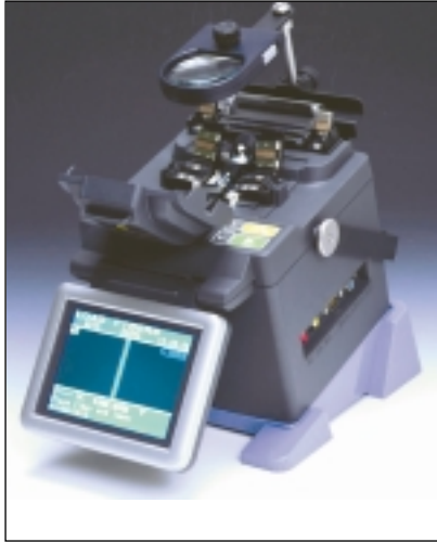
Model S176CF Cubic-shaped, Front monitor design

The S176CF is a compact, lightweight splicer with the monitor and keypad in front and the protection sleeve heater at the rear. The windshield opens rear-to-front for easy access to the heater. Either AC/DC converter or battery can be inserted into the main body and the detachable, wedge-shaped base tilts the splicer forward for comfortable access to the splice chamber.