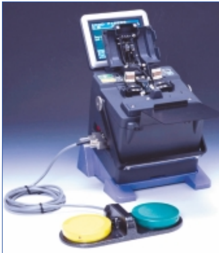
Model S176CR Cubic-shaped, Rear monitor design

The S176CF is a compact, lightweight splicer with the monitor and keypad in front and the protection sleeve heater at the rear. The windshield opens rear-to-front for easy access to the heater. Either AC/DC converter or battery can be inserted into the main body and the detachable, wedge-shaped base tilts the splicer forward for comfortable access to the splice chamber.