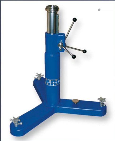
[A] Rolling Stand 50.8 - 170.1cm (20" - 67")

Specifically designed for all FARO Laser Tracker products, this heavy-duty stand is built for maximum portability and stability.