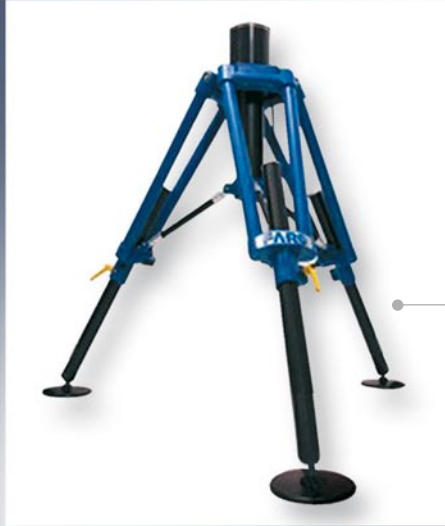
[B] Folding Stand

Specifically designed for all FARO Laser Tracker products, this heavy-duty stand is built for maximum portability and stability.