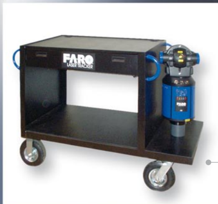
[D] Small Workstation Cart

A convenient work centre for the FARO Laser Tracker.