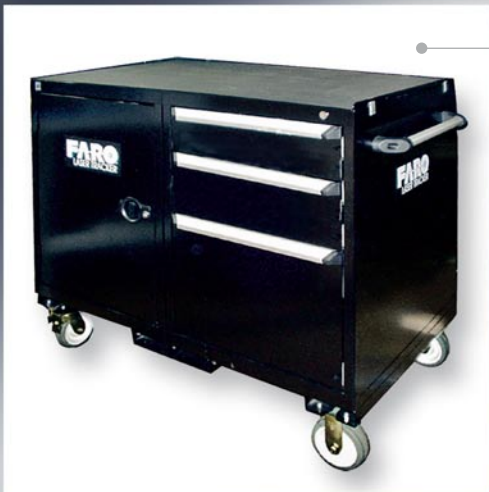
[C] Large Workstation Cart

This stand provides the ideal combination of rock-solid mounting with portability.